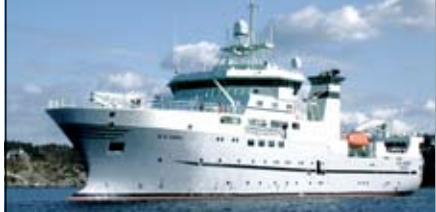
G.O. SARS • built: 2003 • 77,5 m • 4067 brt