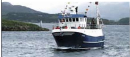
FANGST • built: 2000 • 15,0 m • 25 brt

A comprehensive programme for the research cruises is prepared annually, based on ongoing and planned research. This is challenging puzzle in which research requirements, efficient vessel operation and concerns of the ships' personnel must all be taken into account. The Institute programme forms part of a national research cruise programme prepared since 2006.