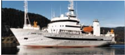
JOHAN HJORT • built: 1990 • 64,4 m • 910 brt