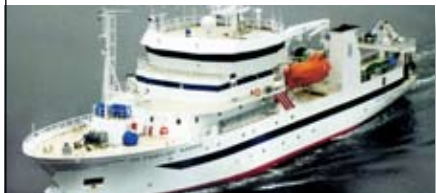
DR. FRIDTJOF NANSEN • built: 1993 • 56,7 m • 1444 brt