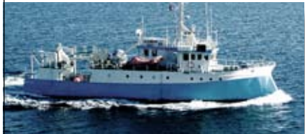
G.M. DANNEVIG • built: 1979 • 27,8 m • 171 brt