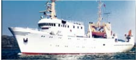
HÅKON MOSBY • built: 1980 • 47,5 m • 493 brt